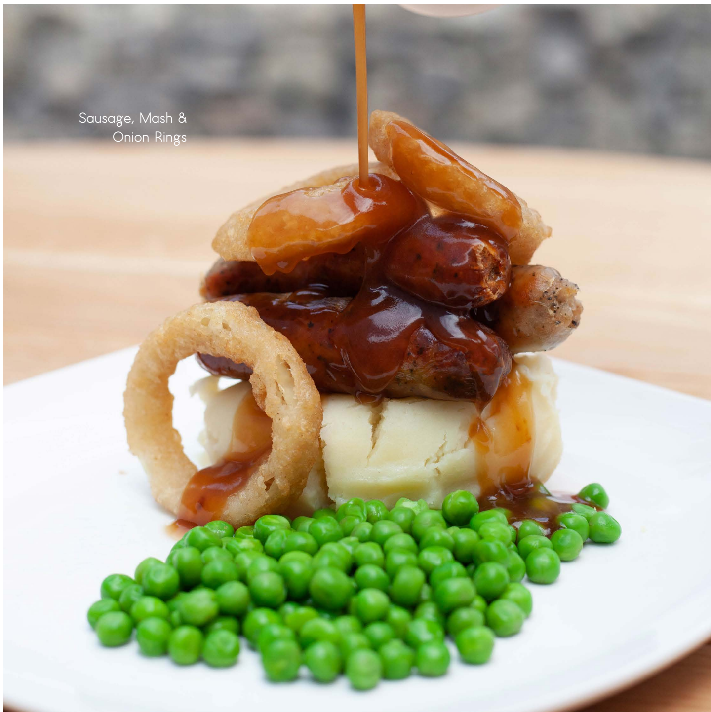
Sausage, Mash & Onion Rings