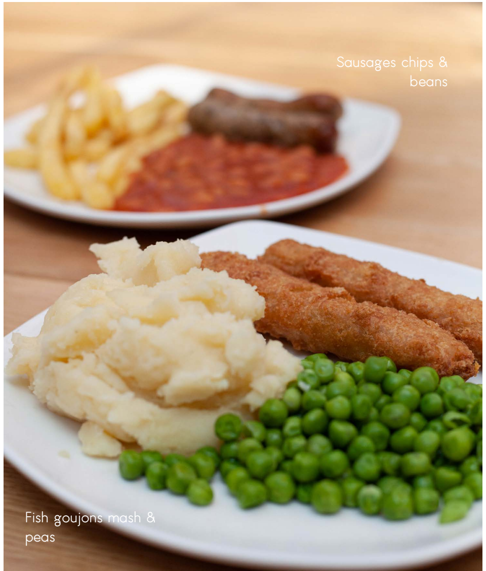
Sausages chips & beans