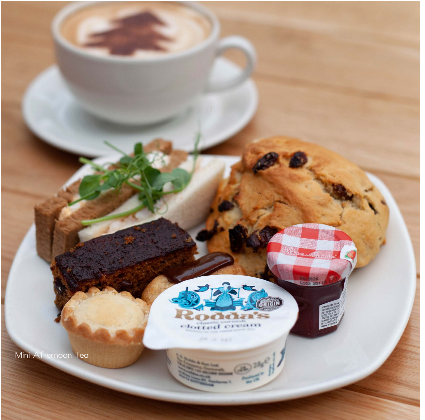
Mini Afternoon Tea